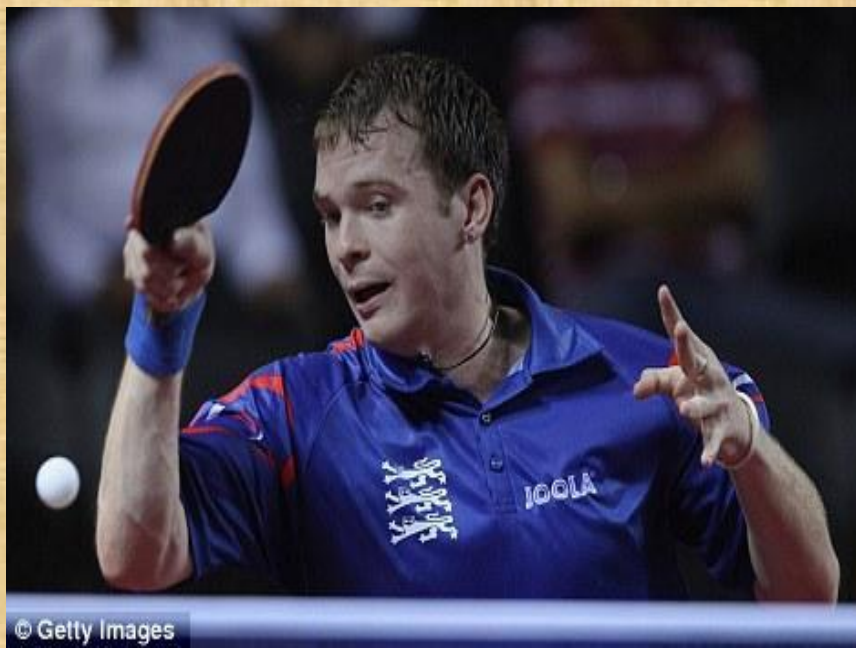
Table tennis was invented in England in 1880. It began with Cambridge University students using cigar boxes and champagne corks.

Although the game originated in England, British players don't have much luck in international championships.