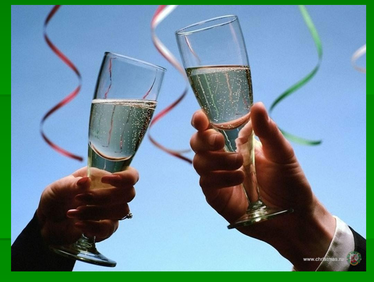
So Christmas is a merry family holiday for all people in Great Britain.