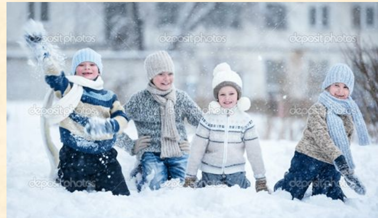
Playing in the snow