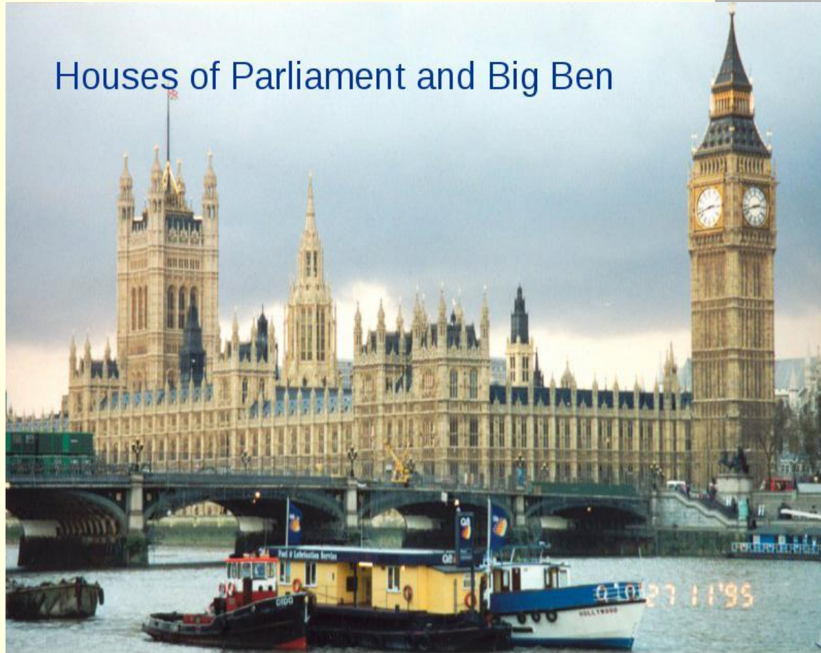
Houses of Parliament and Big Ben