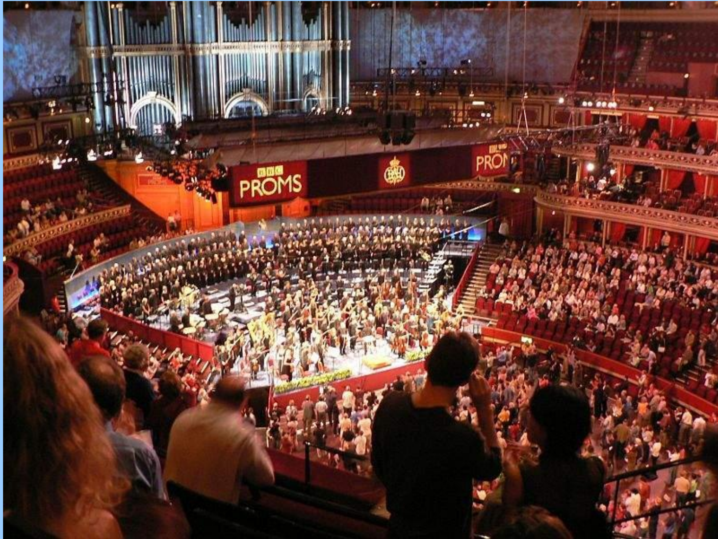
Figure 3. The Proms 2005. Most people sit, while Promenaders stand in front of the orchestra. The Royal Albert Hall Organ is in the background.