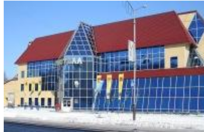
The ice palace "Kristall"