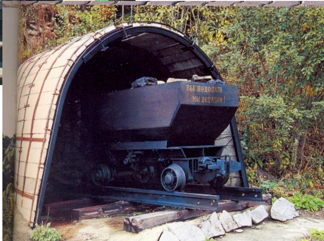
Monument to the fallen miners (the mine of Shevyakova)