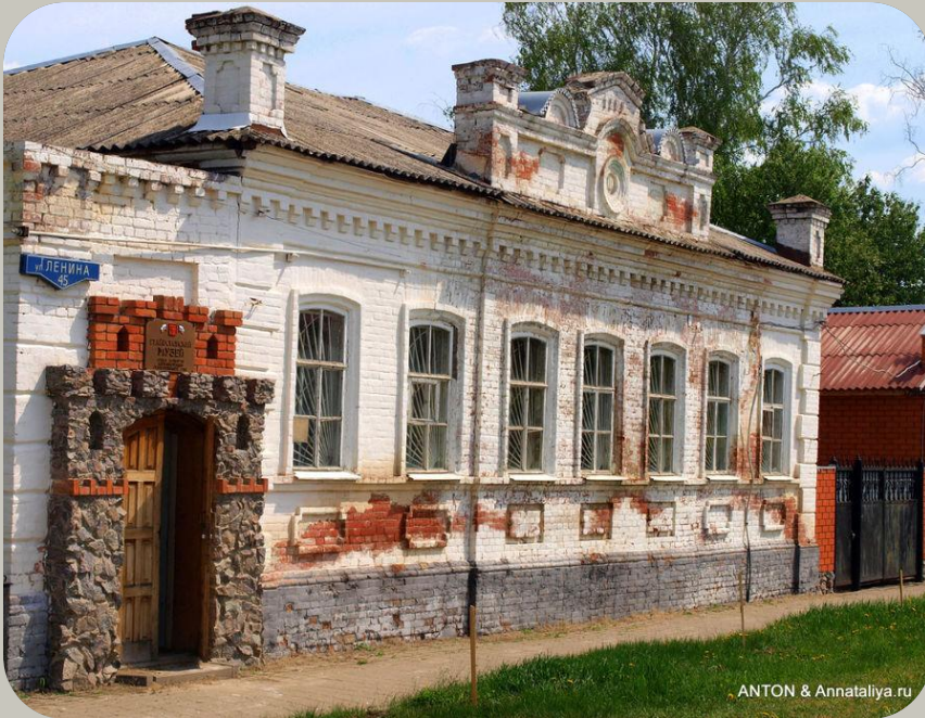
Graivoron ethnography museum