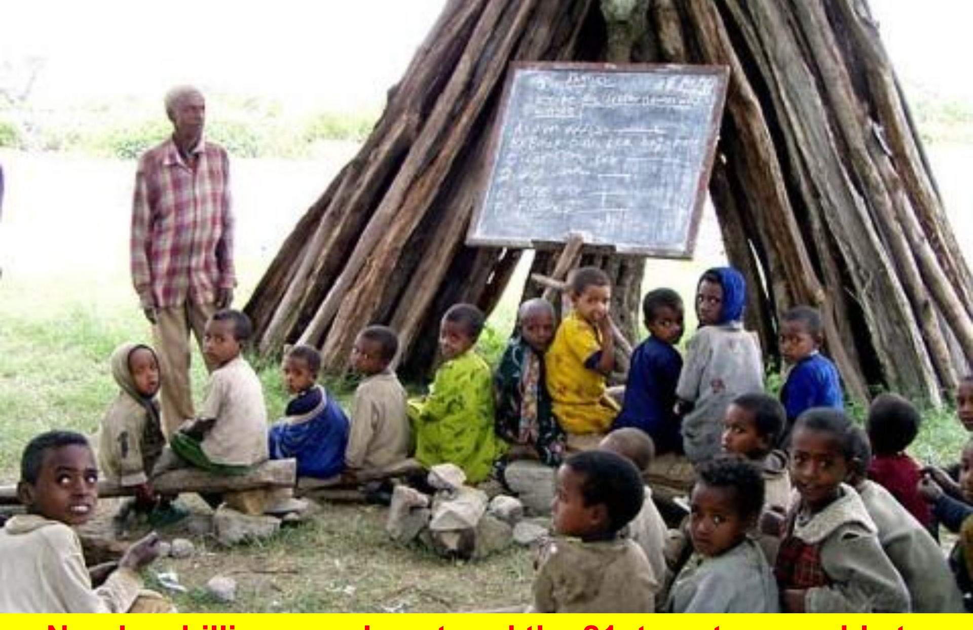
Nearly a billion people entered the 21st century unable to read a book or sign their names.