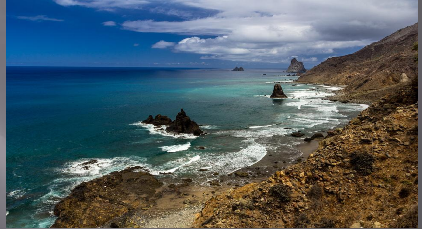
The Irish Sea