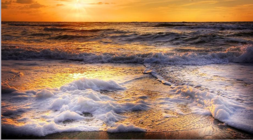
The English Channel

The British Isles are separated from European continent by the North Sea and the English Channel. The western coast of Great Britain is washed by the Atlantic Ocean and the Irish Sea.