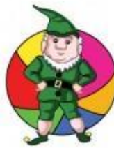
in front of