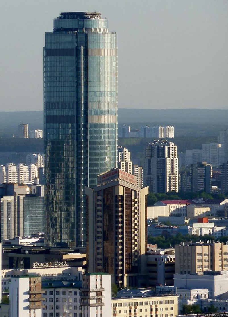
THE TALLEST BUILDING IN RUSSIA OUTSIDE OF MOSCOW - BUSINESS CENTER VYSOTSKY