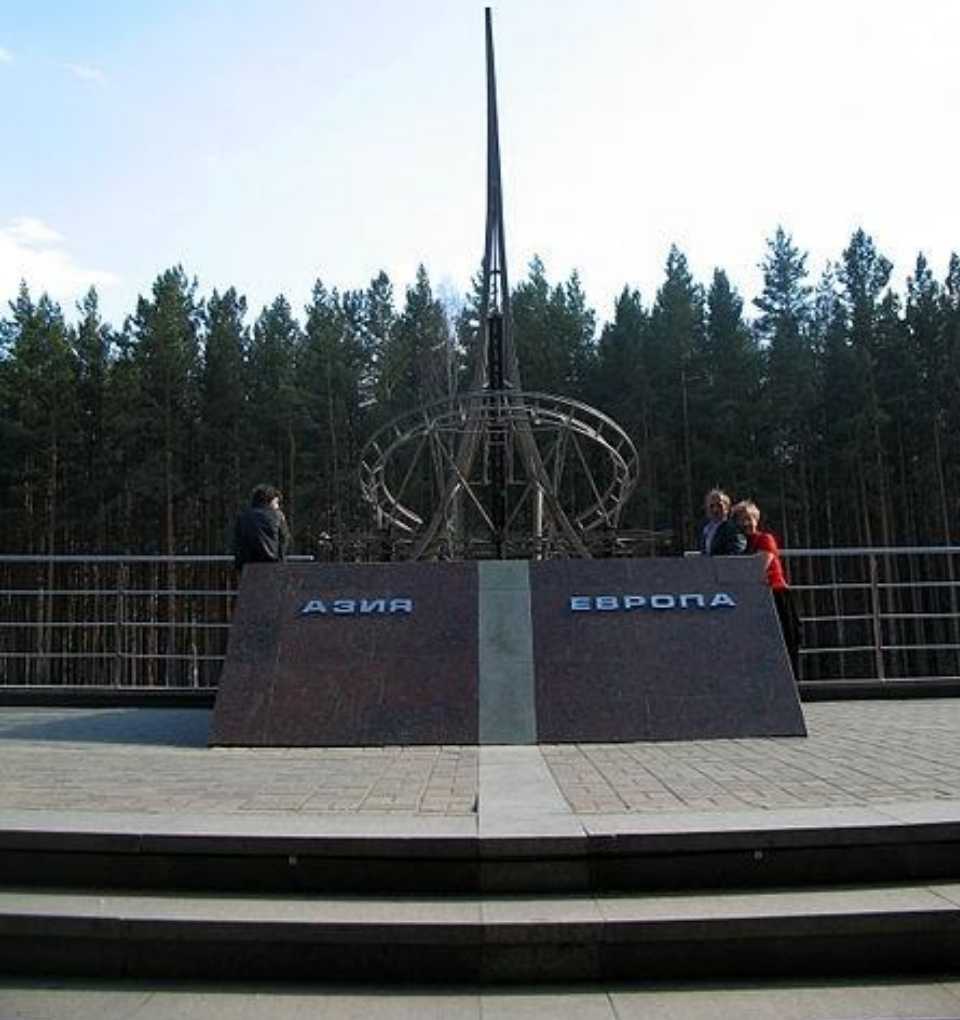
THE BORDER BETWEEN EUROPE AND ASIA

MONUMENT TO EKATERINBURG FOUNDERS V. TATISHCHEV AND G. WILHELM DE GENNIN