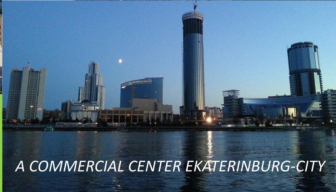
A COMMERCIAL CENTER EKATERINBURG-CITY