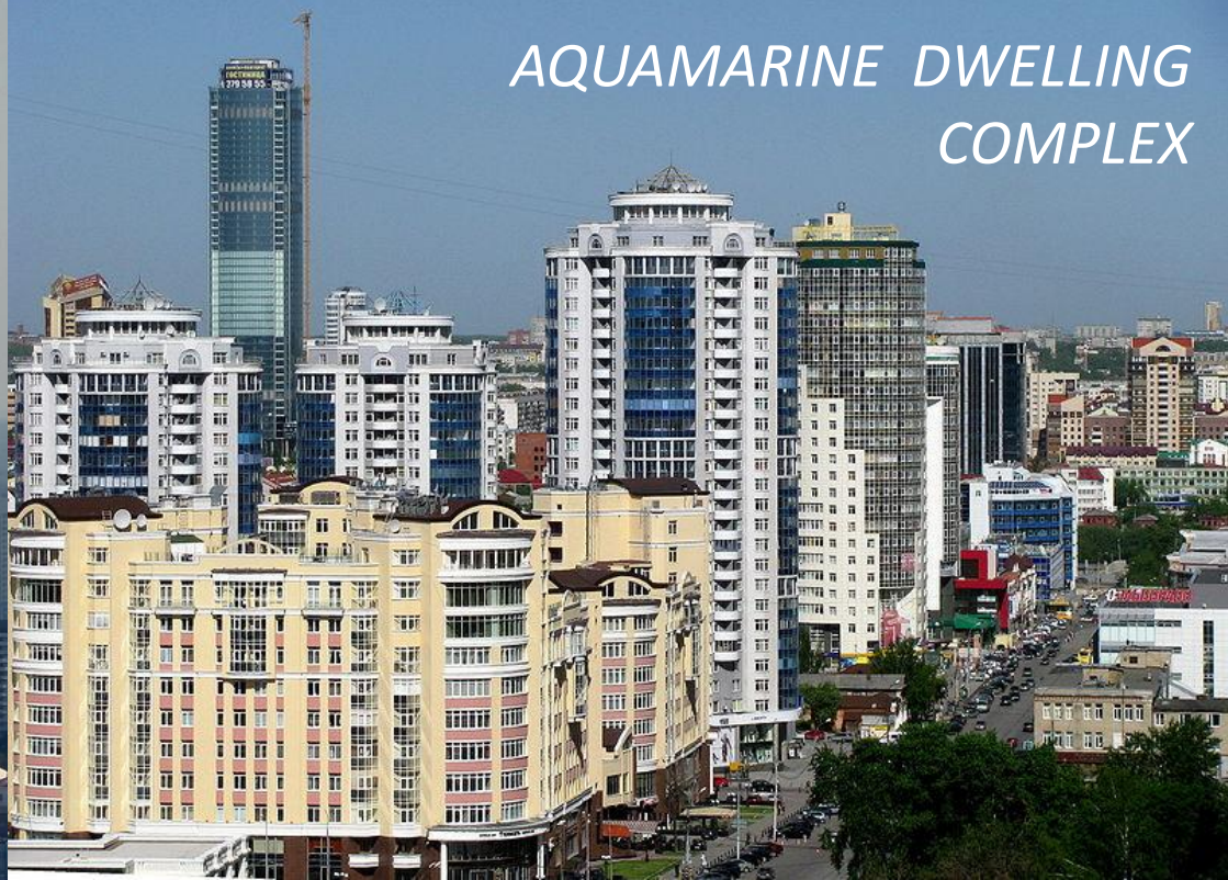
AQUAMARINE DWELLING COMPLEX