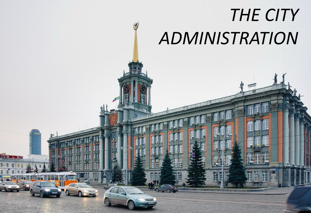
THE CITY ADMINISTRATION