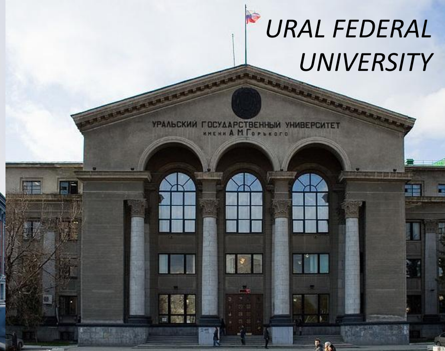
URAL FEDERAL UNIVERSITY