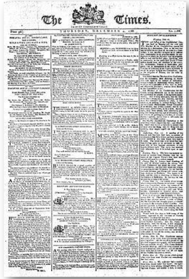
Front page of The Times from 4 December 1788