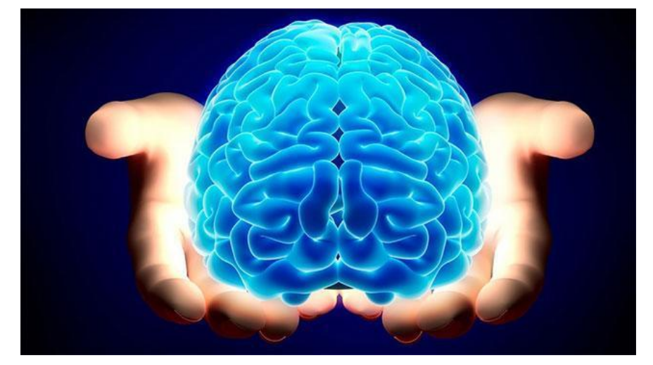
subconscious level of the brain