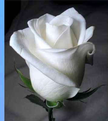
b. a white rose