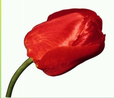
a. a red tulip