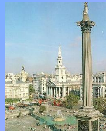
d. Trafalgar Square