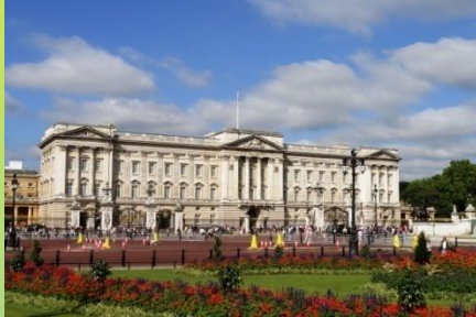
a. Buckingham Palace