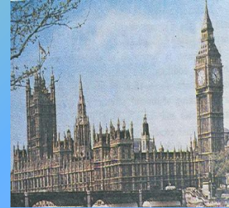
b. The Houses of Parliament