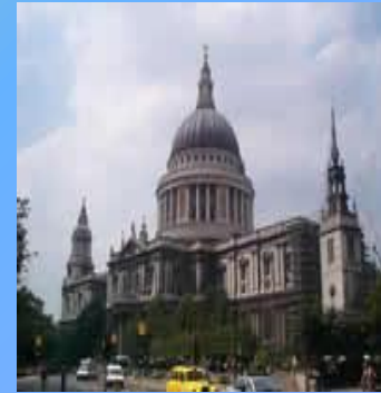
b. St. Paul's Cathedral