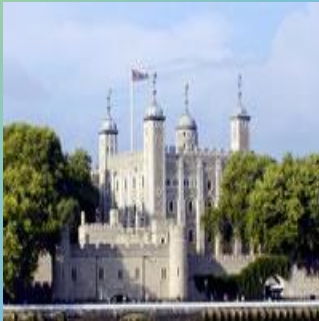
c. The Tower of London