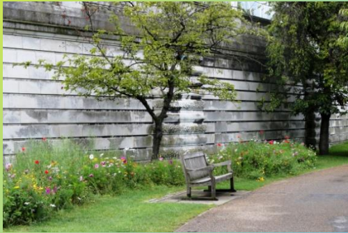
a. St. James's Park