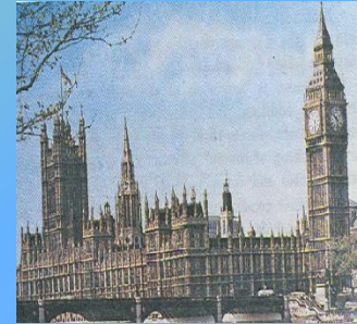
b. The Houses of Parliament