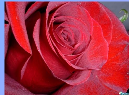
d. a red rose