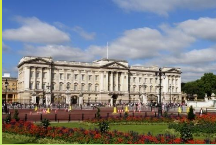
a. Buckingham Palace