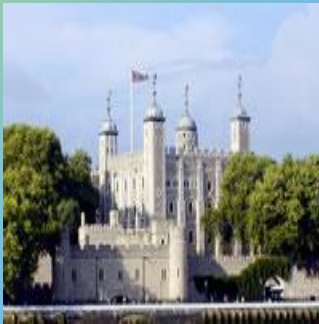
c. The Tower of London