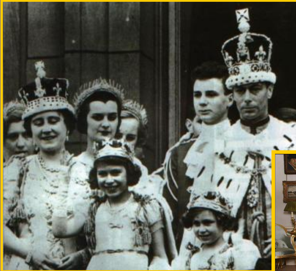
Elizabeth II with a sister and parents