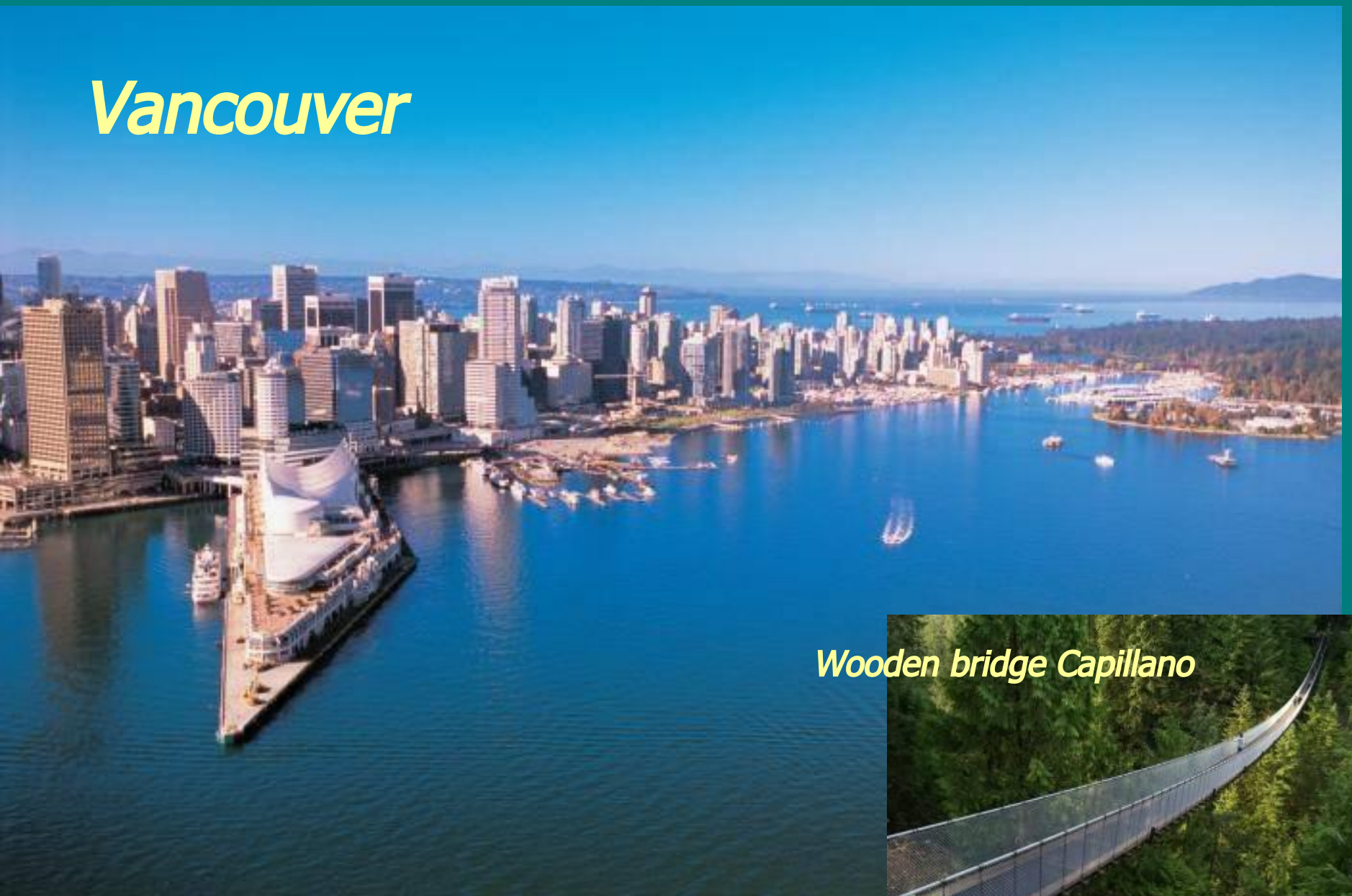
Wooden bridge Capillano