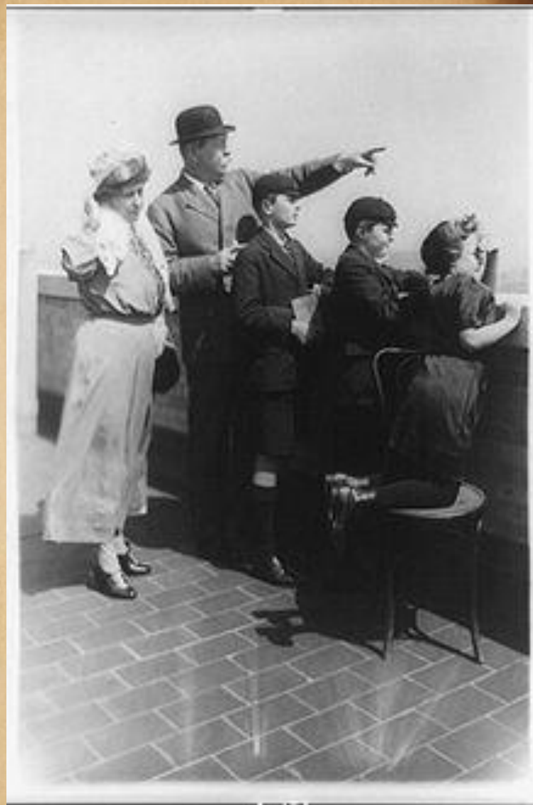
Conan Doyle's family in New York 1922