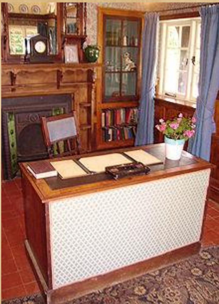
Doyle's study at Groombridge Place