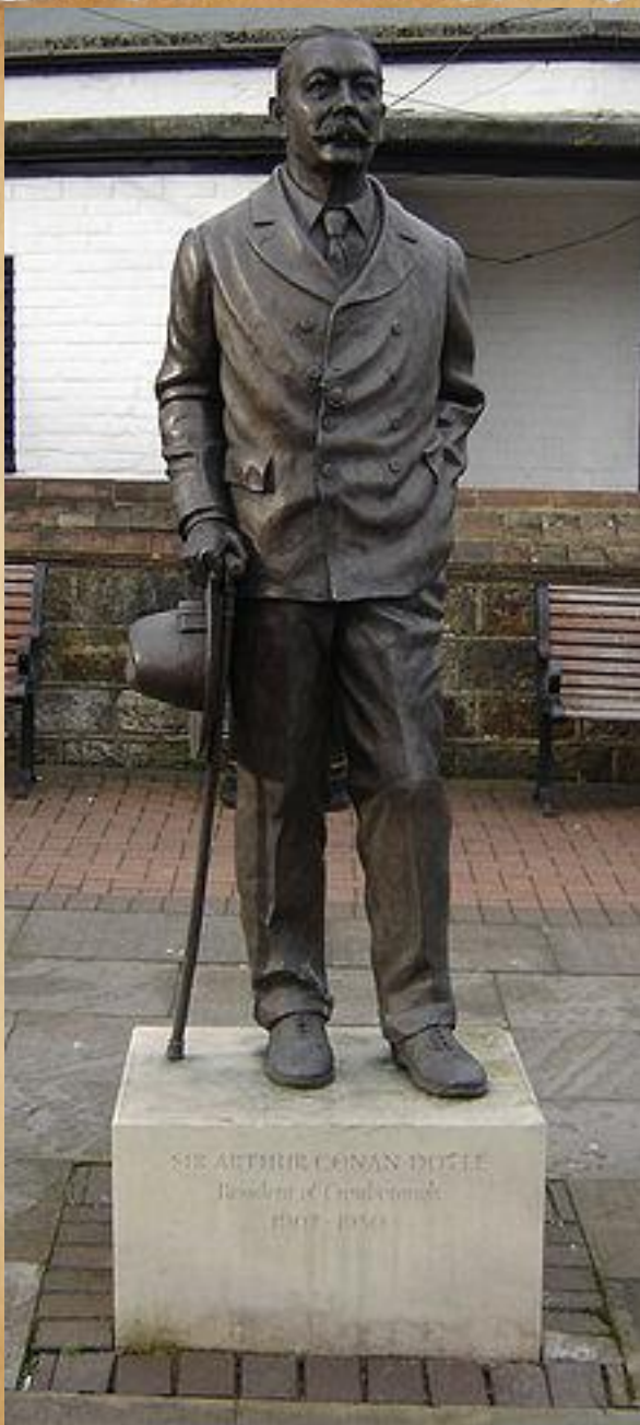
Arthur Conan Doyle statue in Crowborough