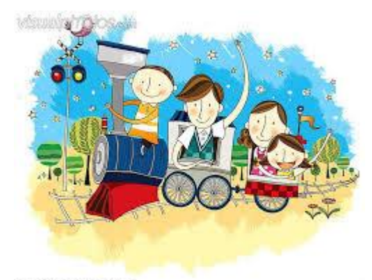
22001006 [67] O www.vtw/aptictos.com