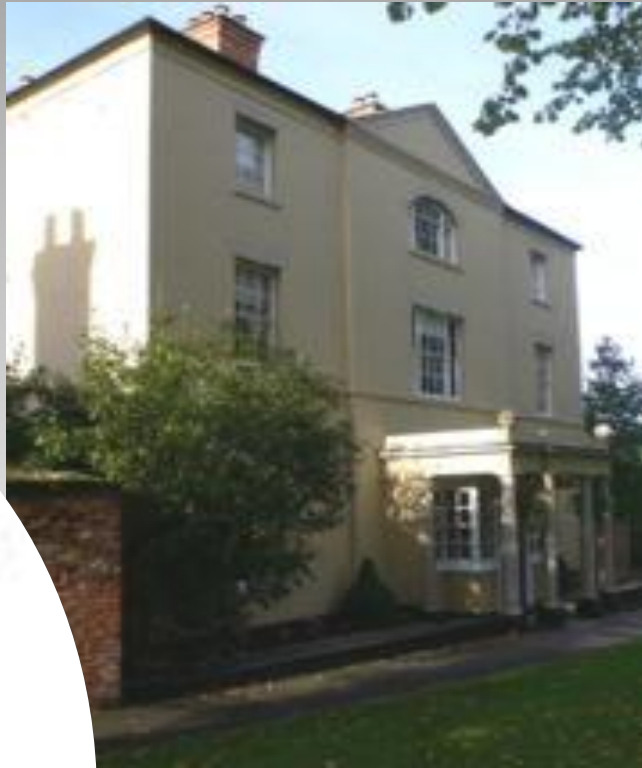
Byron's house in Newstead