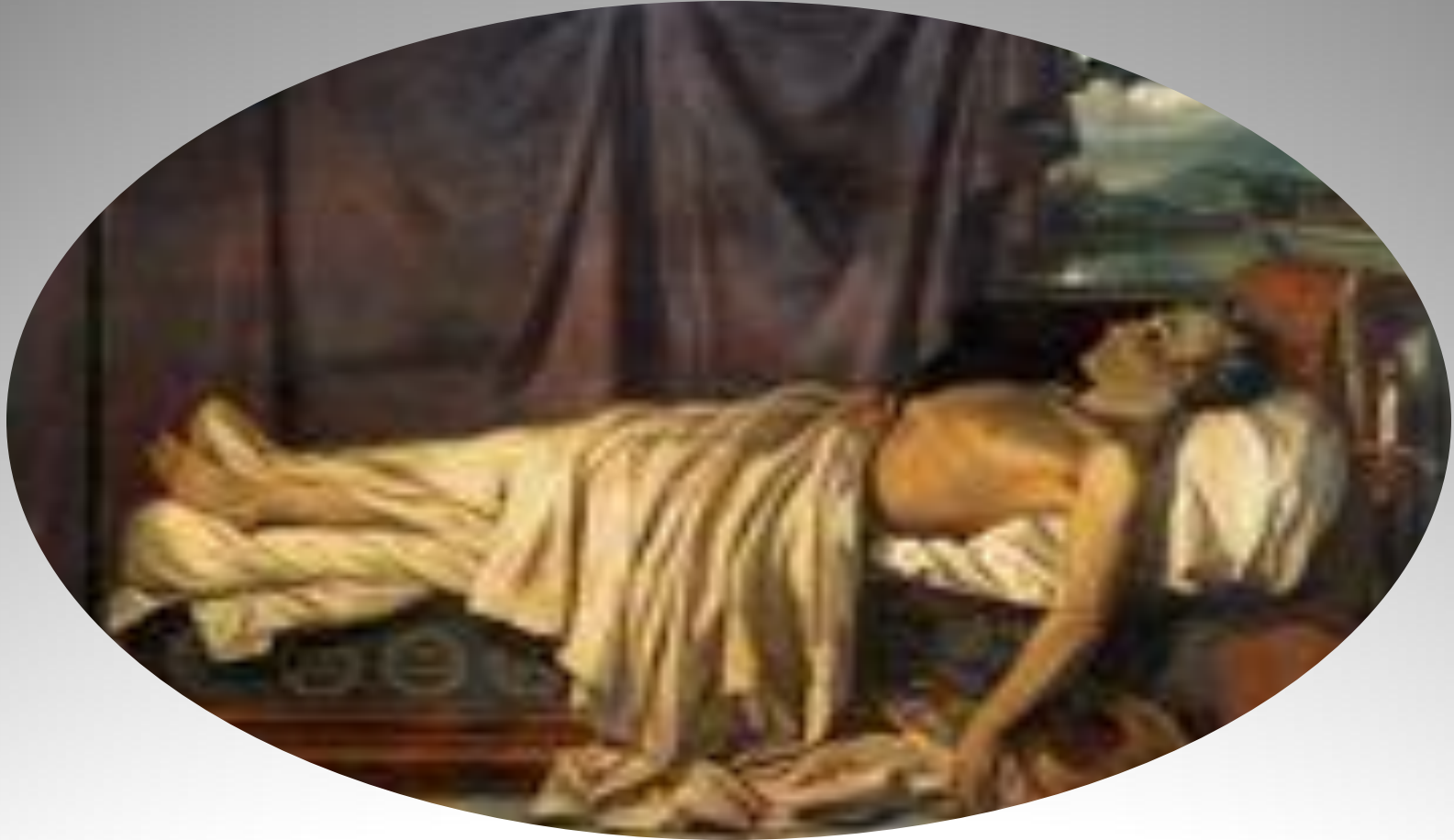
BYRON lying on deathbed by Joseph-Denis Odevaere