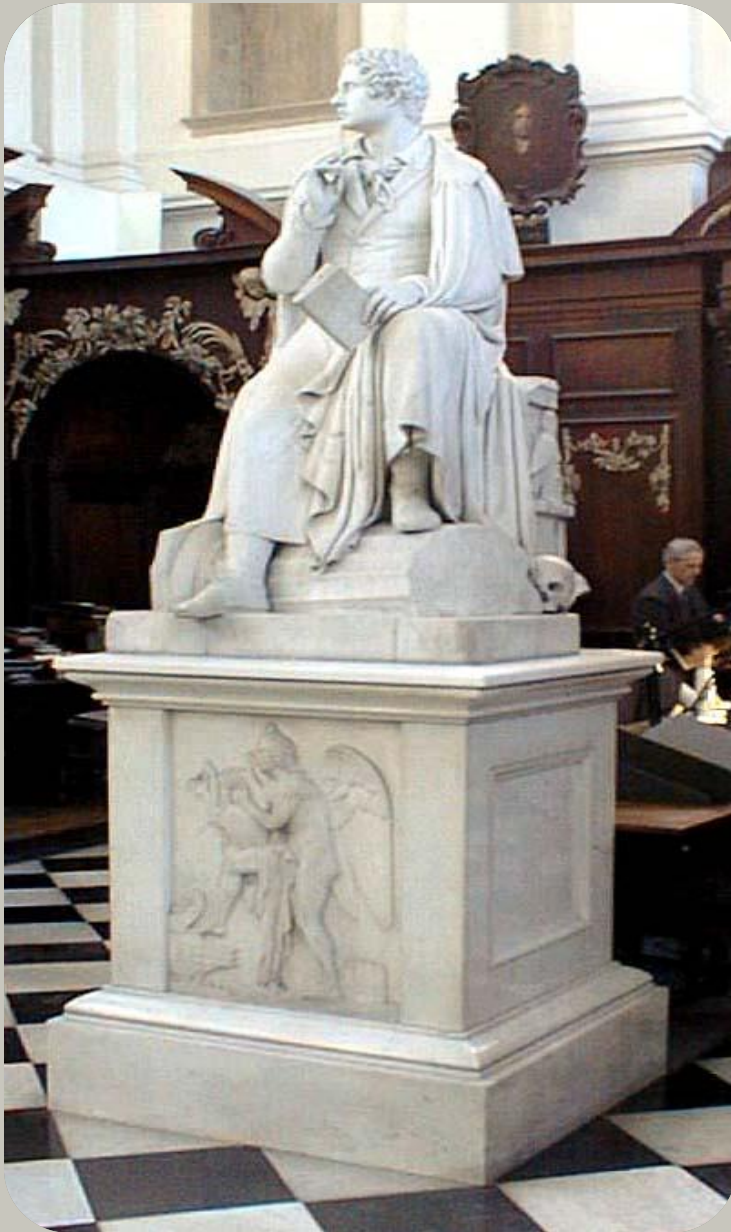
Statue of BYRON At Trinity College, Cambridge