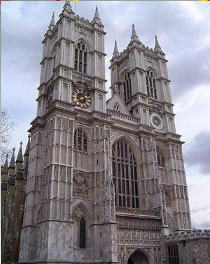
← Westminster Abbey

However, this was refused by the English authorities, and the poet's body, already transported from Greece to England, was buried in the family vault near Newstead.