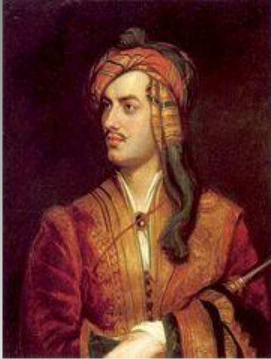
BYRON by Marie Louise Vigée-Lebrun

While in Switzerland, Byron wrote the third canto of “Childe Harold’s Pilgrimage”(1816), “The Prisoner of Chillon” (1816), the dramatic poem “Manfred”(1817), and many lyrics.