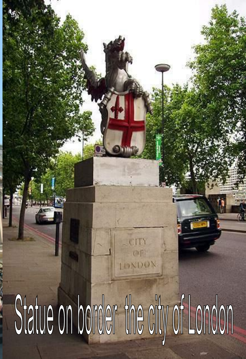
Statue on border the city of London