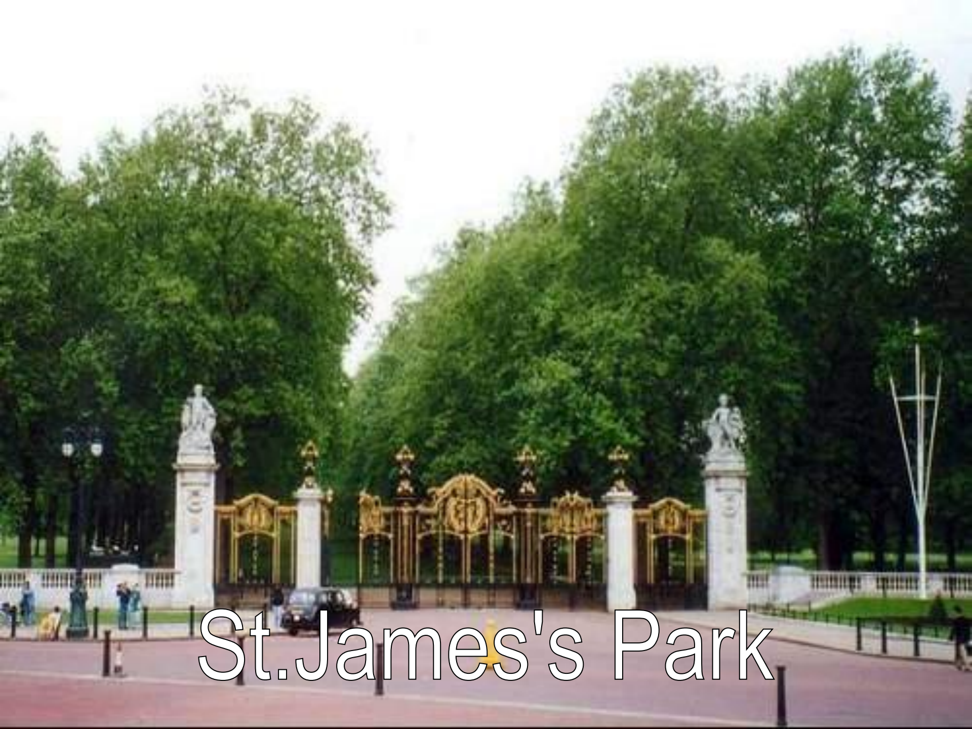
St. James's Park