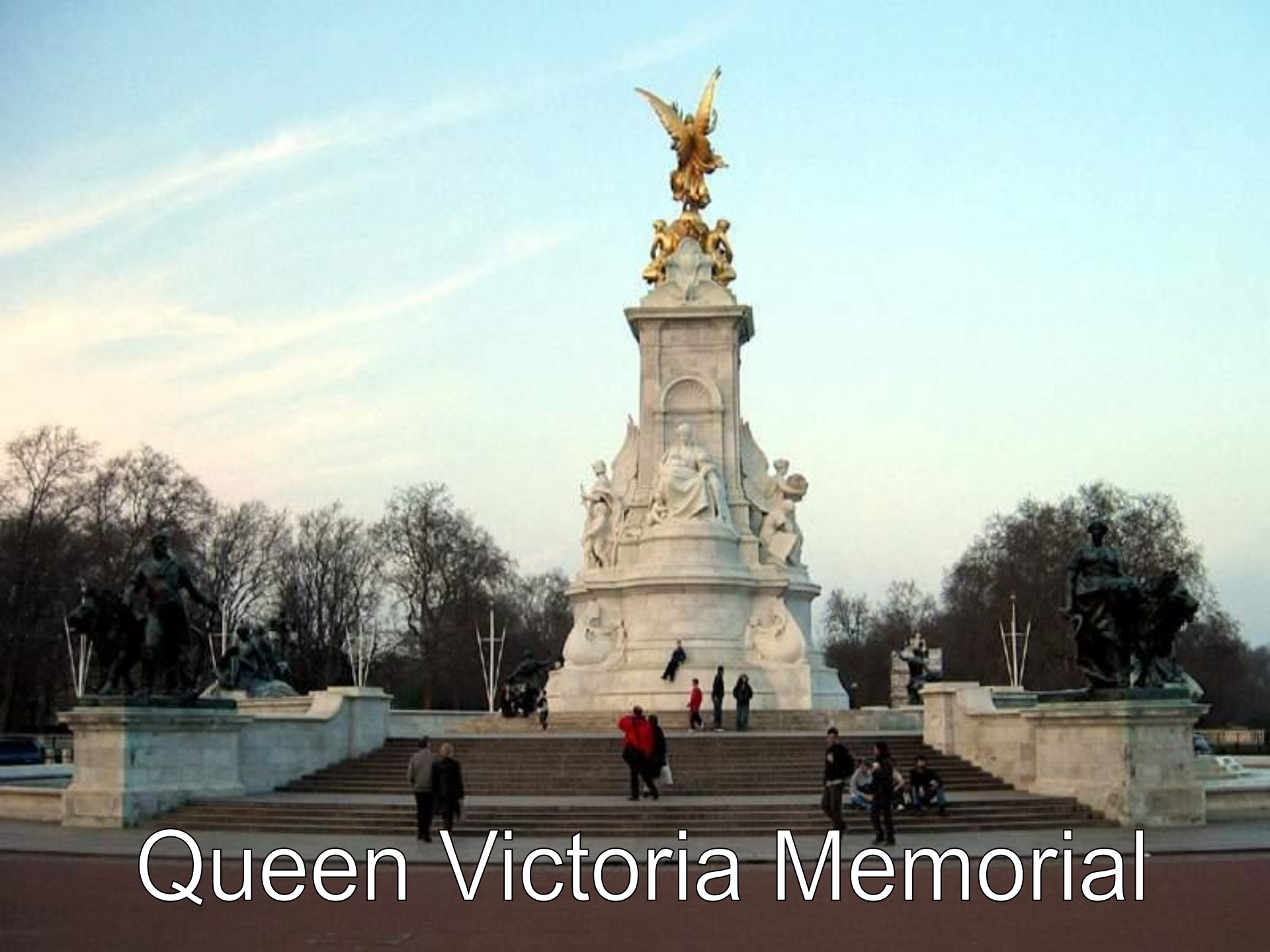
Queen Victoria Memorial