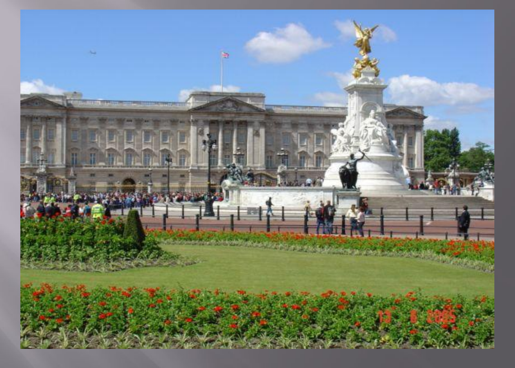
Buckingham Palace is the official residence of the British Monarch.