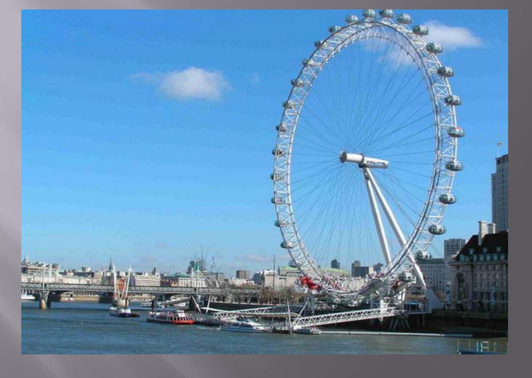
London Eye - the biggest observation wheel in the world.