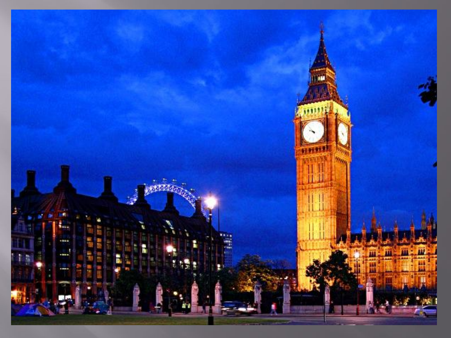
Big Ben is the name of the great bell.