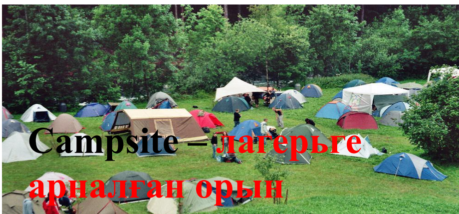
Campsite – лагерге арналған орын