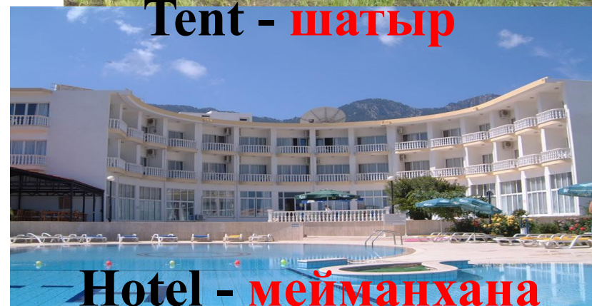
Hotel - мейманхана