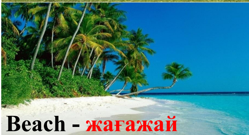
Beach - жағажай