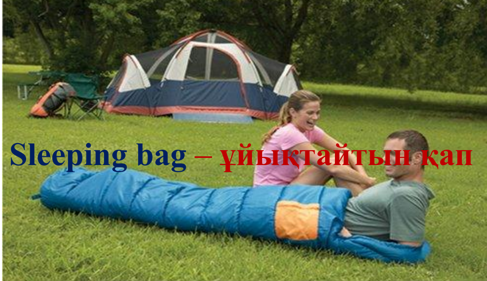
Sleeping bag – ұйықтайтын қап