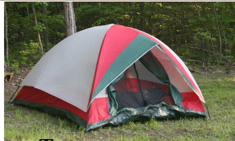
Tent - шатыр