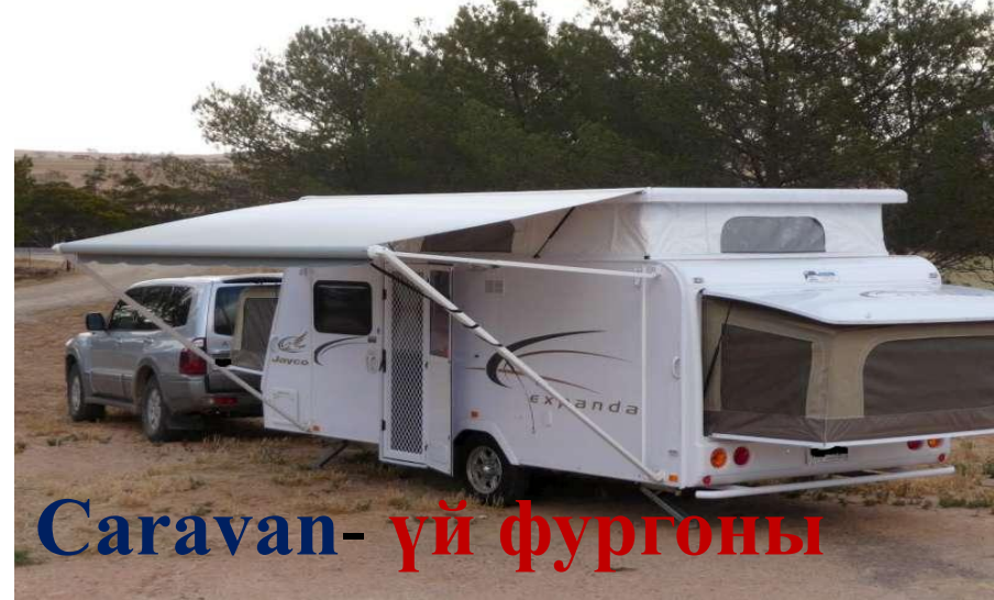
Caravan- үй фургоны