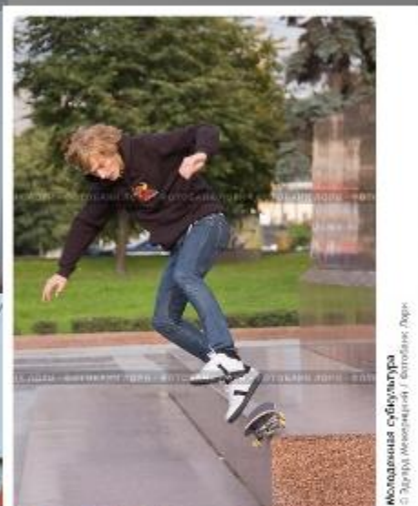
Молодежная субкультура