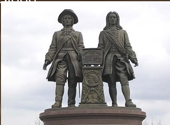
Monument Tatischev and Degenin