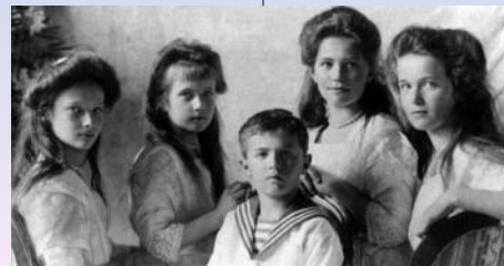
Grand Duchesses and Tsarevich Alexey