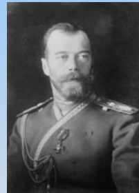
Tsar Nicholas II