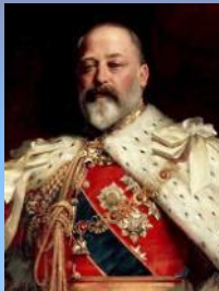
King Edward VII