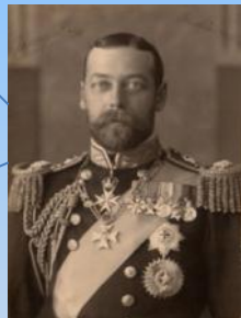
King George V