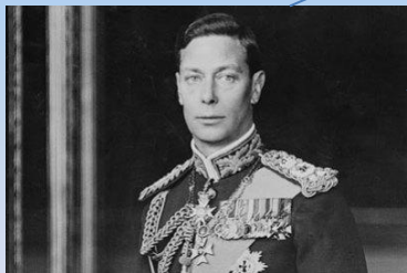
King George VI