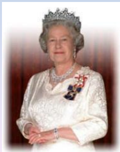
Queen Elizabeth II